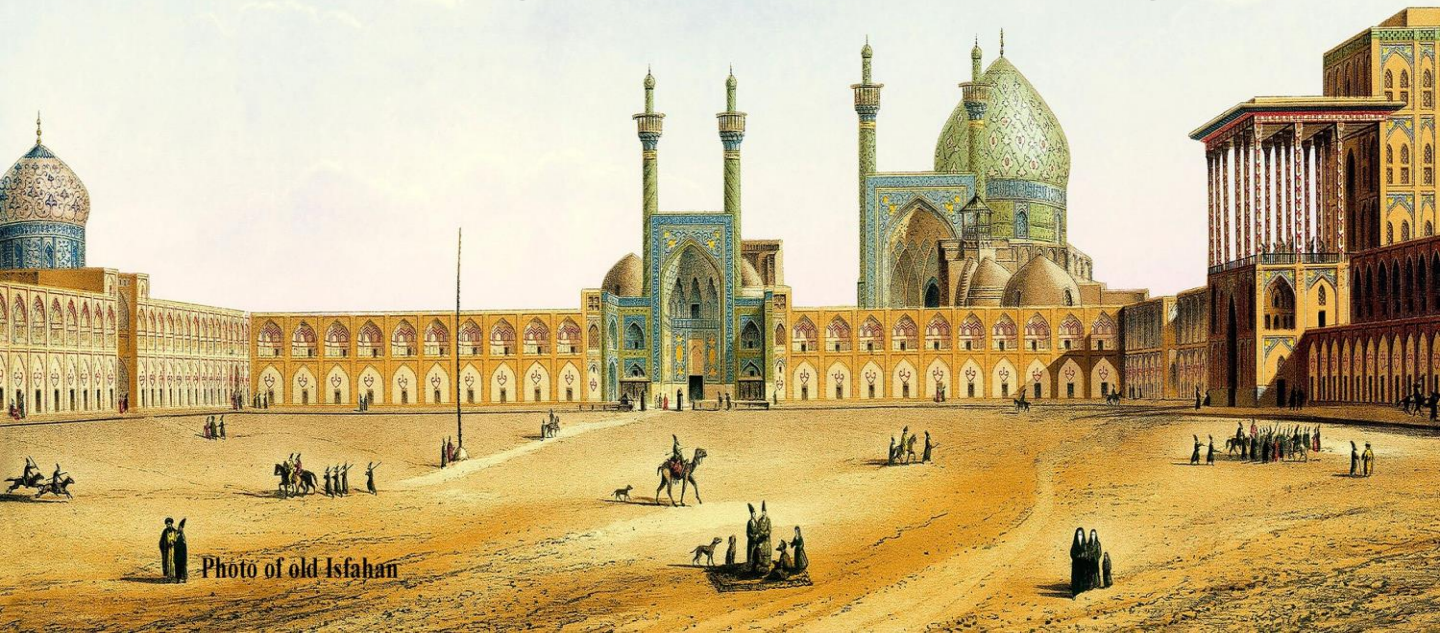
Photo of old Isfahan

The golden era of Isfahan was from the 9th to the 18th century, when Isfahan was made the capital of Persia for the third time during the Safavid dynasty, where much of its history is well maintained. The city is well-known for its historical monuments including the covered bridges, magnificent boulevards, tiled mosques, minarets, artworks, and Perso-Islamic architecture. The city is recalled as "Isfahan Nesfe- Jahan" – "Isfahan half the world". Naqsh-e Jahan Square, one of the biggest city squares in the world, is recognized by UNESCO as a World Heritage Site.